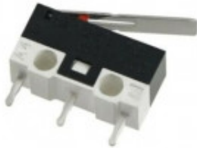
Mini Micro Limit Switch Ultra Small 1A

Produktkode: 843 Tilgjengelighet: 9 Custom Field 5 (Location): I 21