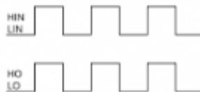
Figure 1. Input/Output Timing Diagram