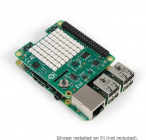
Shown installed on Pi (not included).